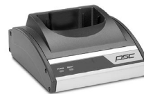
Falcon® Dock also available